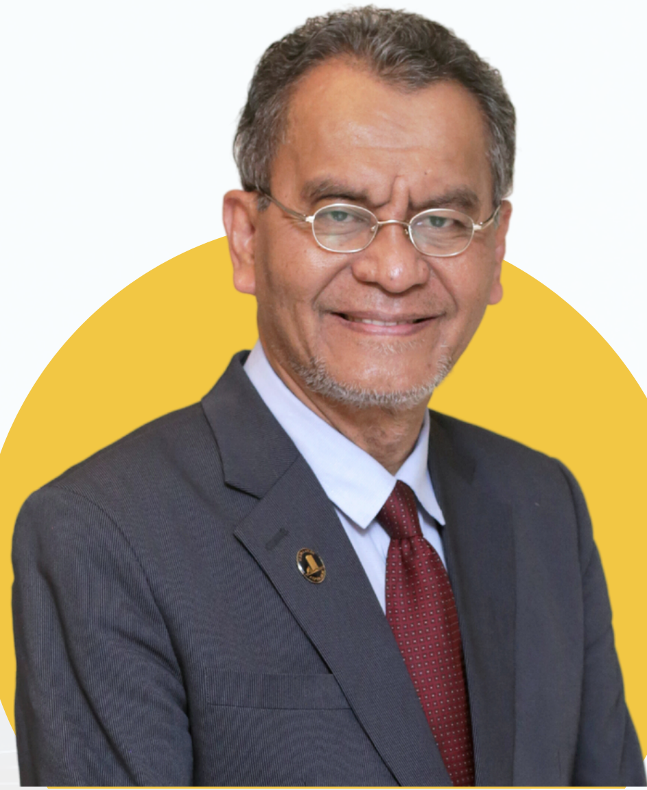
YB DATUK SERI DR. DZULKEFLY BIN AHMAD

CHAIRMAN OF HEALTH FOR THE PARLIAMANTARY SPECIAL SELECT COMMITTEES (PSSC)