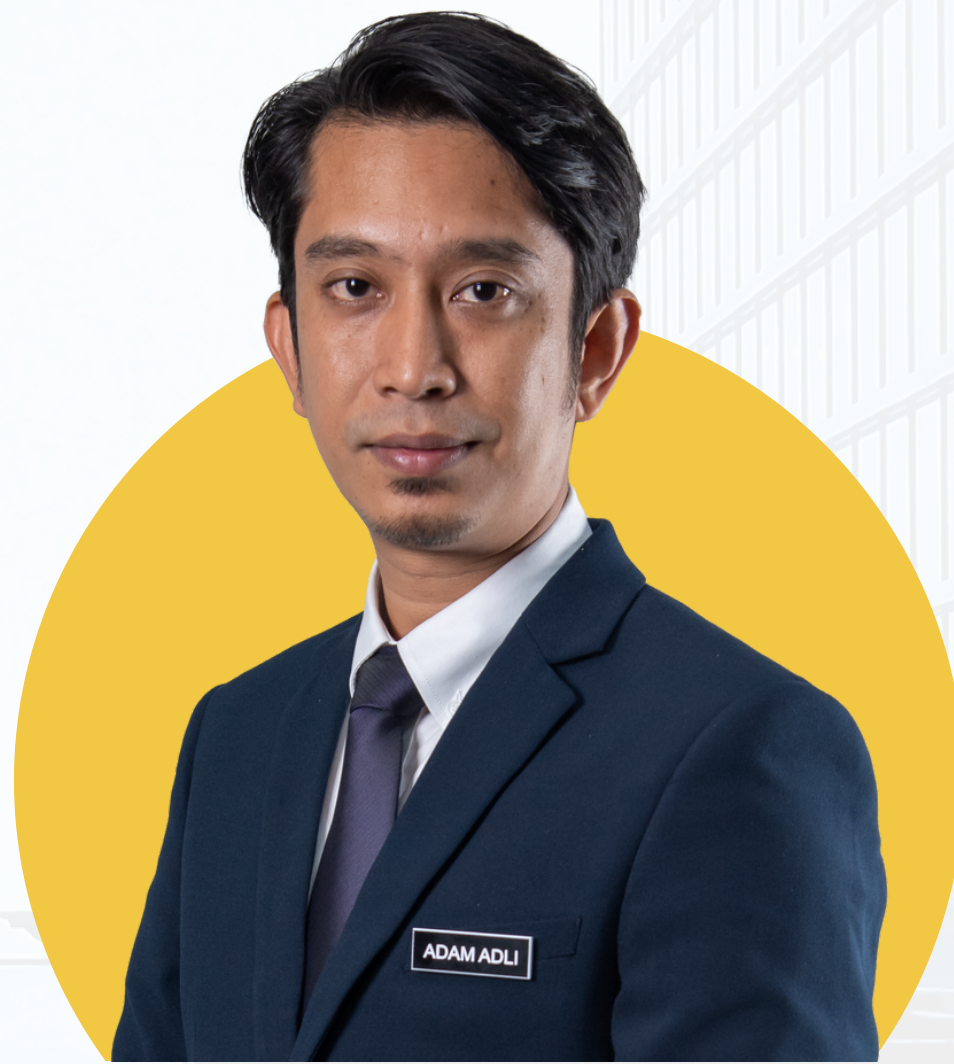
YB ADAM ADLI

CHAIRMAN OF HEALTH FOR THE PARLIAMANTARY SPECIAL SELECT COMMITTEES (PSSC)